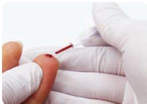
10-50 \mu L finger-prick whole blood#