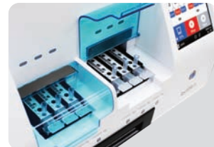
Bay random access (2 bays)

Cardiac | Emergency | Infection | Endocrine | Thyroid | Diabetes